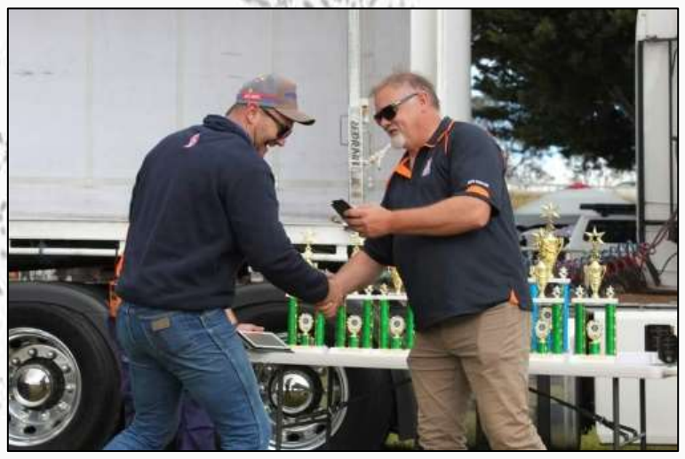
Will accepting Competitors Choice - Truck - Award 2023