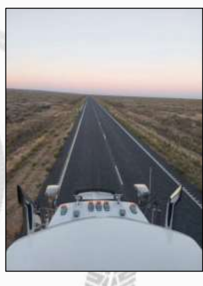
Al's road train at Australia's longest straight road – The 90 Mile Straight.